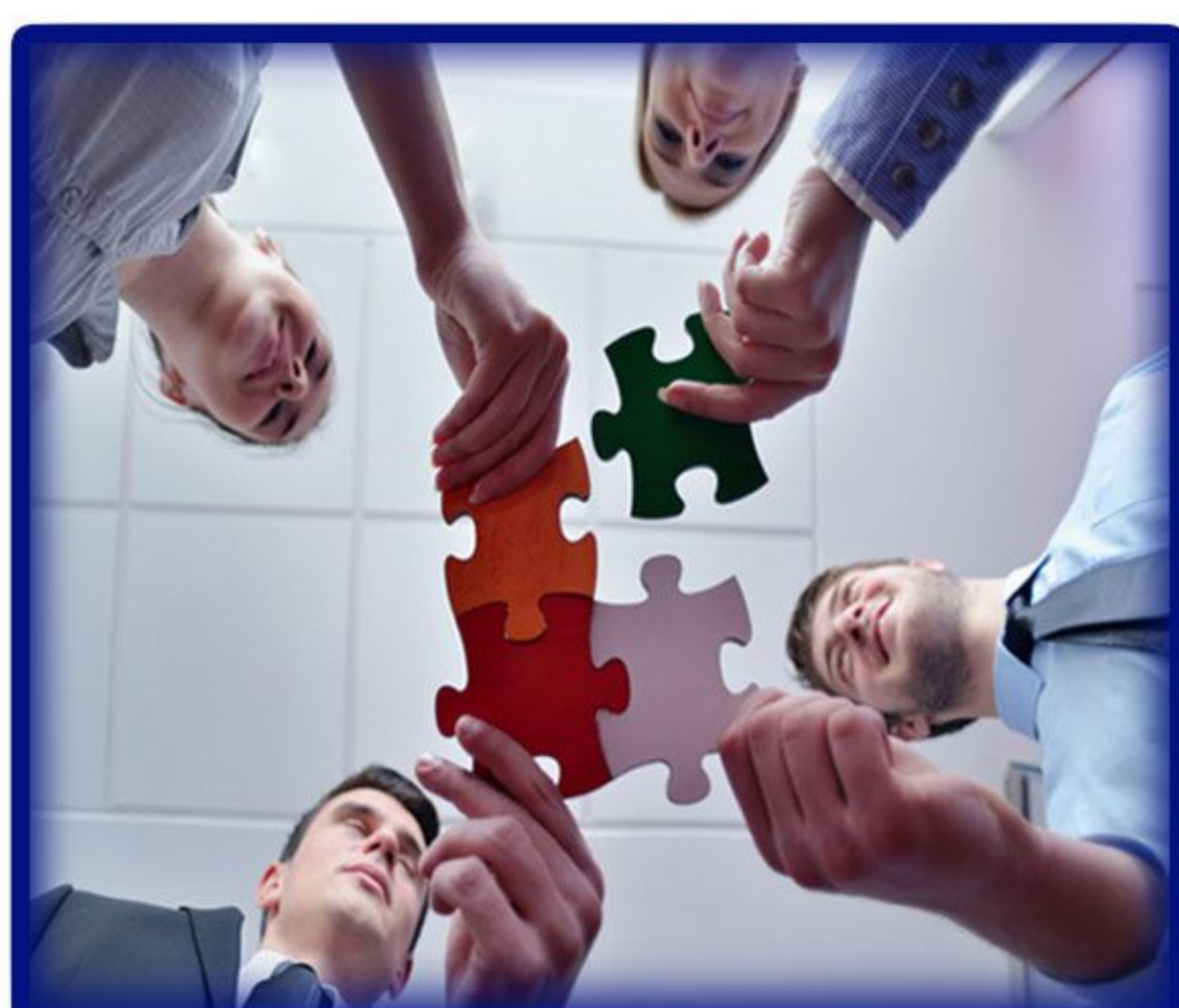
HR & Payroll