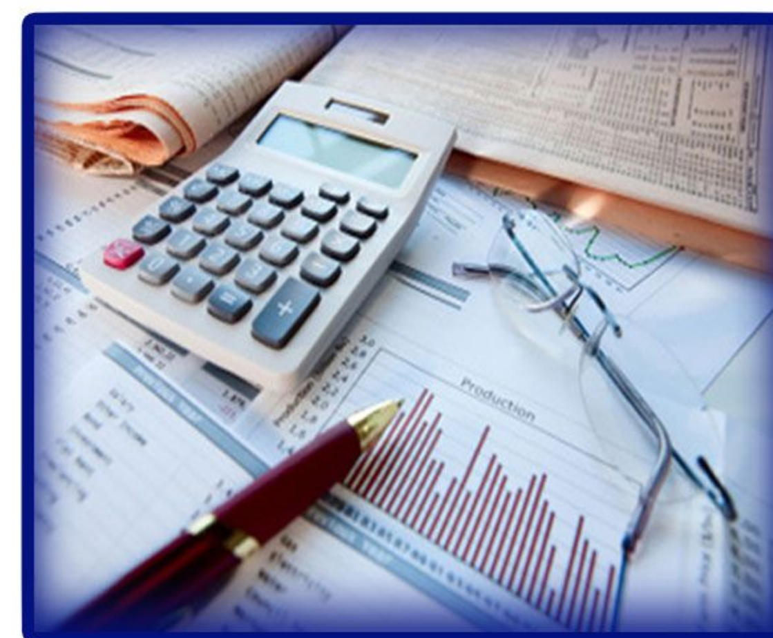
Finance & Account