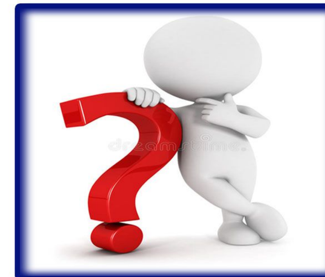
As Per Demand