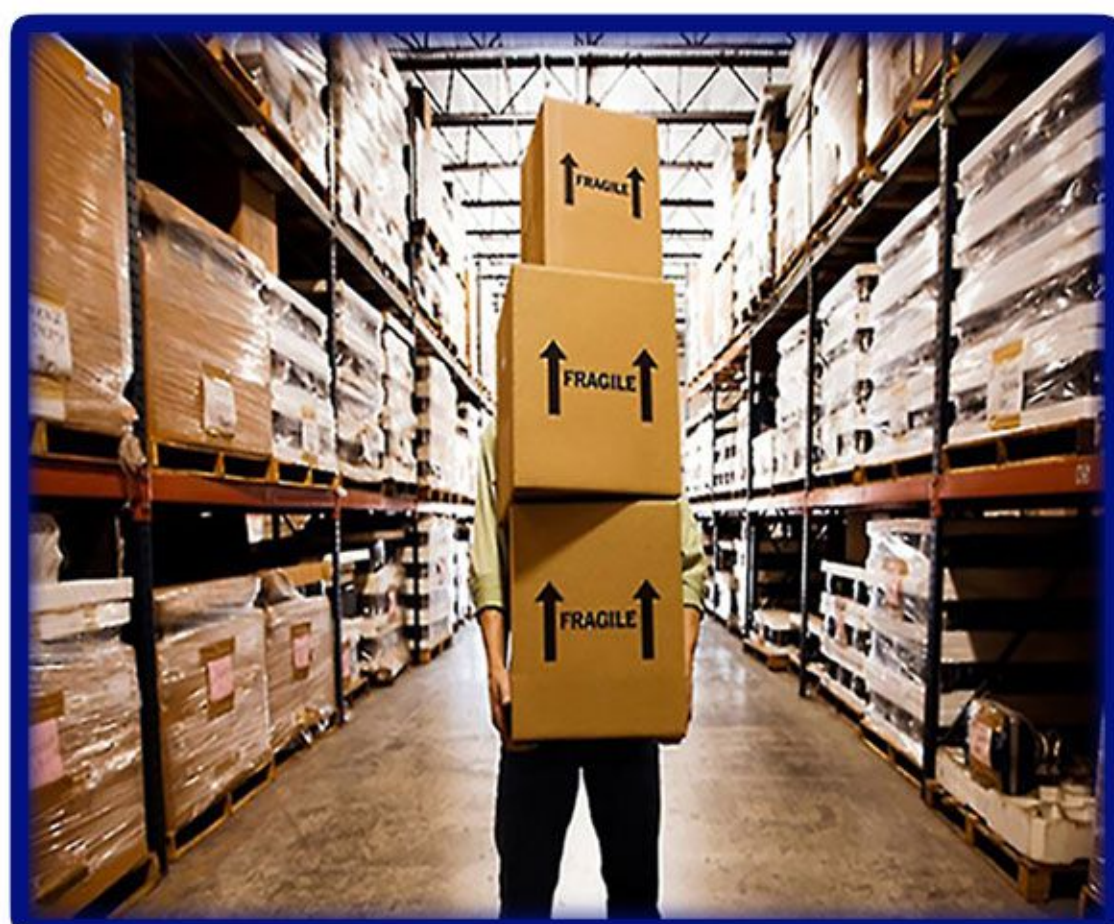
Store & Inventory

A Cloud Base 100% Customize ERP Special In Cycle Parts, Auto Parts & Apparels Industries