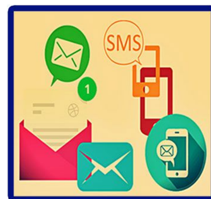
Bulk SMS & Email