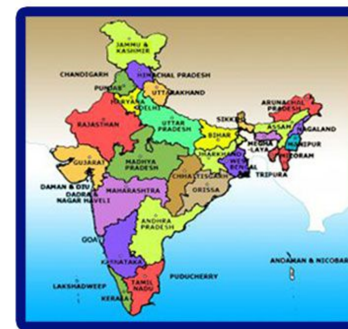
Multi City Control