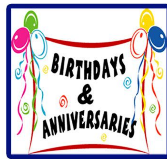
Birthday / Anniversary Wishes