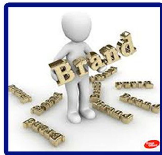
Establish the Brand